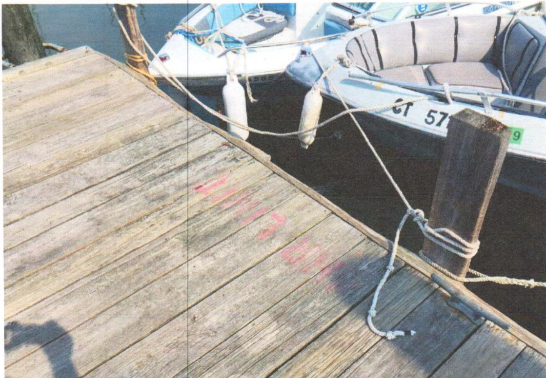
Typical "restriction" markings