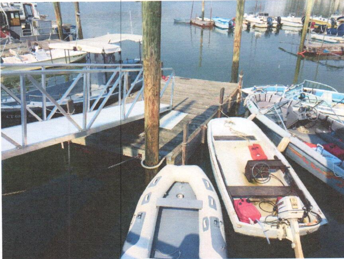
Typical ramp and float (#4)