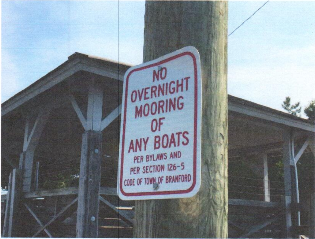
Typical Overnight Warning signs posted (one per float)